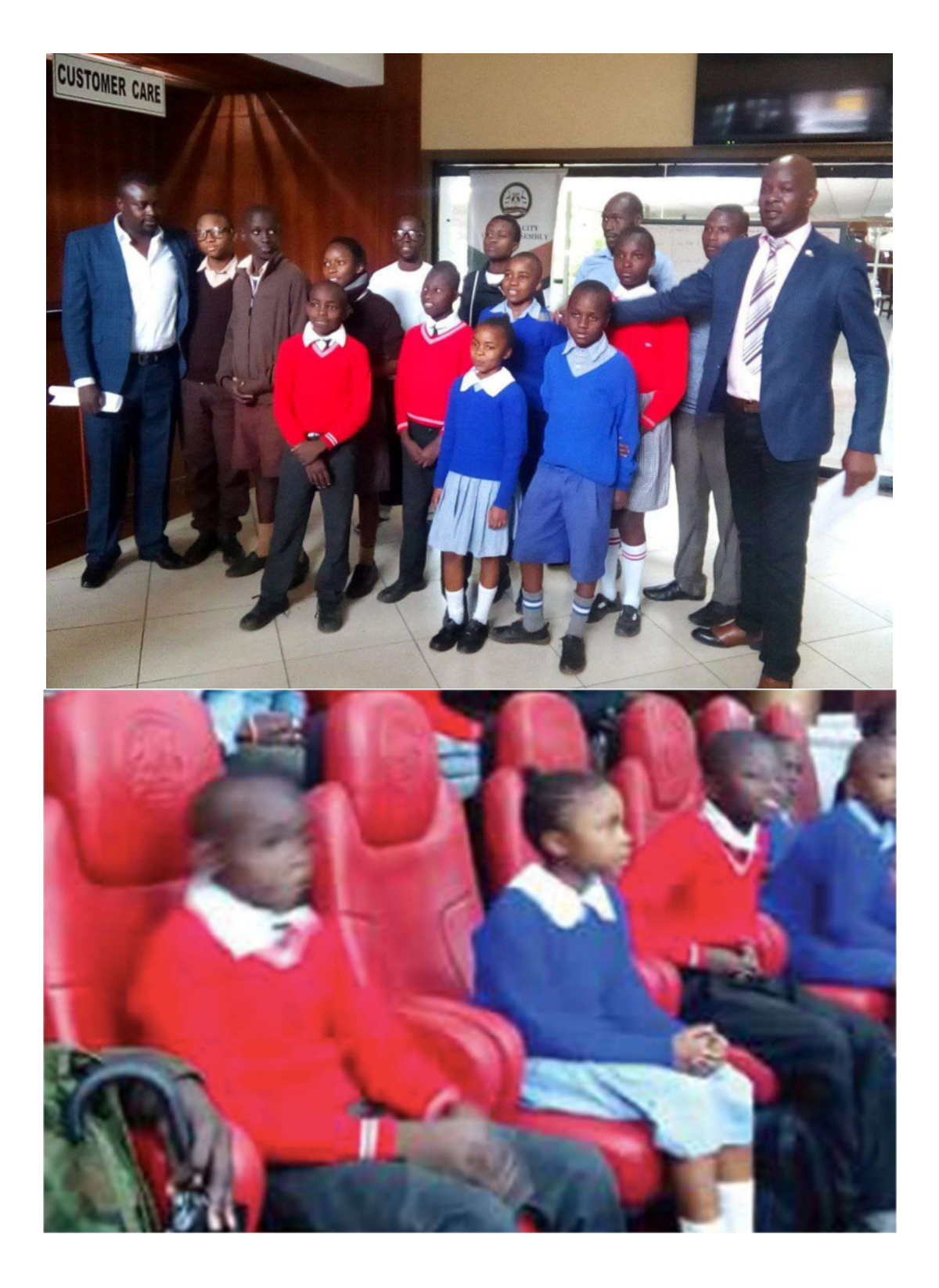
In 2019 member of county assembly by then sponsored a trip to the county assembly for children he was supporting from different schools among them were children from SBCC who are now in secondary schools.