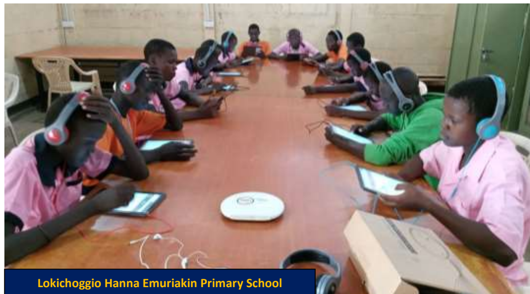
Lokichoggio Hanna Emuriakin Primary School

Thanks to the internal battery, the library can be used completely autonomously for 4 to 5 hours, so you are not tied to any local infrastructure. There is also the option of embedding the server library in a computer lab or making it publicly available. All access to all media is free of charge for the recipient.